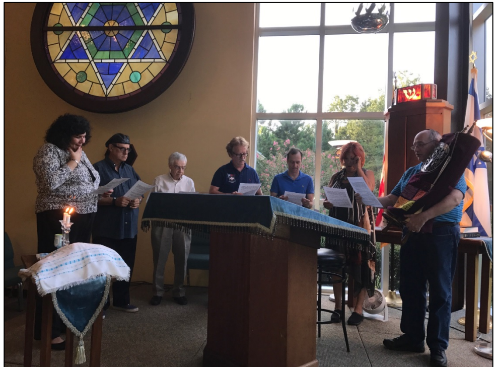
TBT's new Board of Directors was installed during services last month. Please welcome our new and returning board members, and feel free to contact them with any questions, concerns, or suggestions that you have regarding TBT.