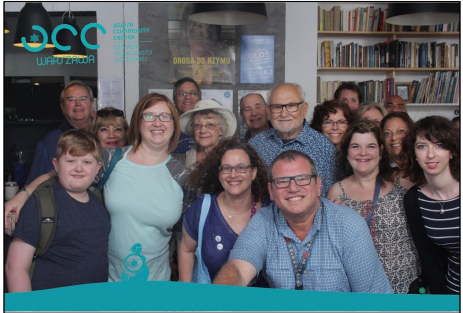
TBT congregants, family, and friends gather for a photo at the Warsaw, Poland Jewish Community Center, where they received a tour and a presentation from local Jewish artists.