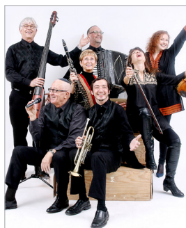
The Koshers Klezmer Band